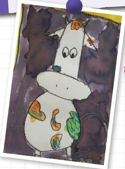
Creates artworks by drawing and painting